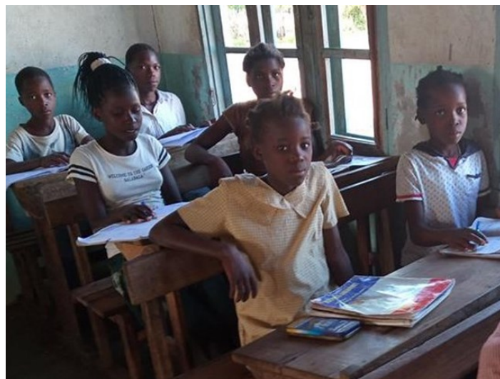
The distance learning students are using a small classroom until the new building is finished.

The distance learning curriculum in Mozambique is developed for Grades 10 to 12. Our hope is to see this expand so the entire community can take courses online. We have an opportunity to acquire donated computers but would need funding to have a program in place for next year. We need to cover the costs of computer monitors, furniture, solar panels, batteries and installation.